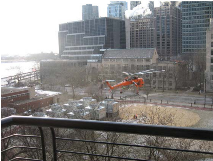
VIEW SOUTH SHOWING HELICOPTER