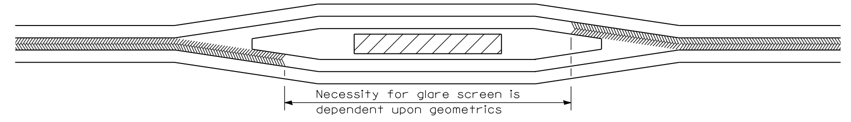
TYPICAL APPLICATION AT MEDIAN OBSTRUCTIONS